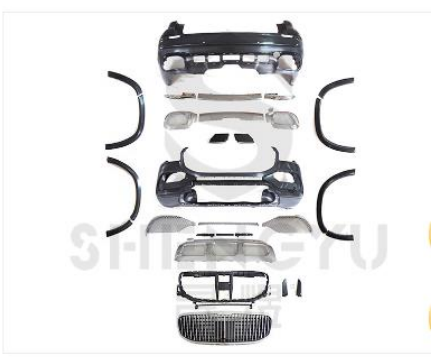
efficiency on the road.